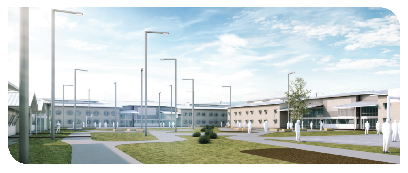
Figure 4: View of internal accommodation block