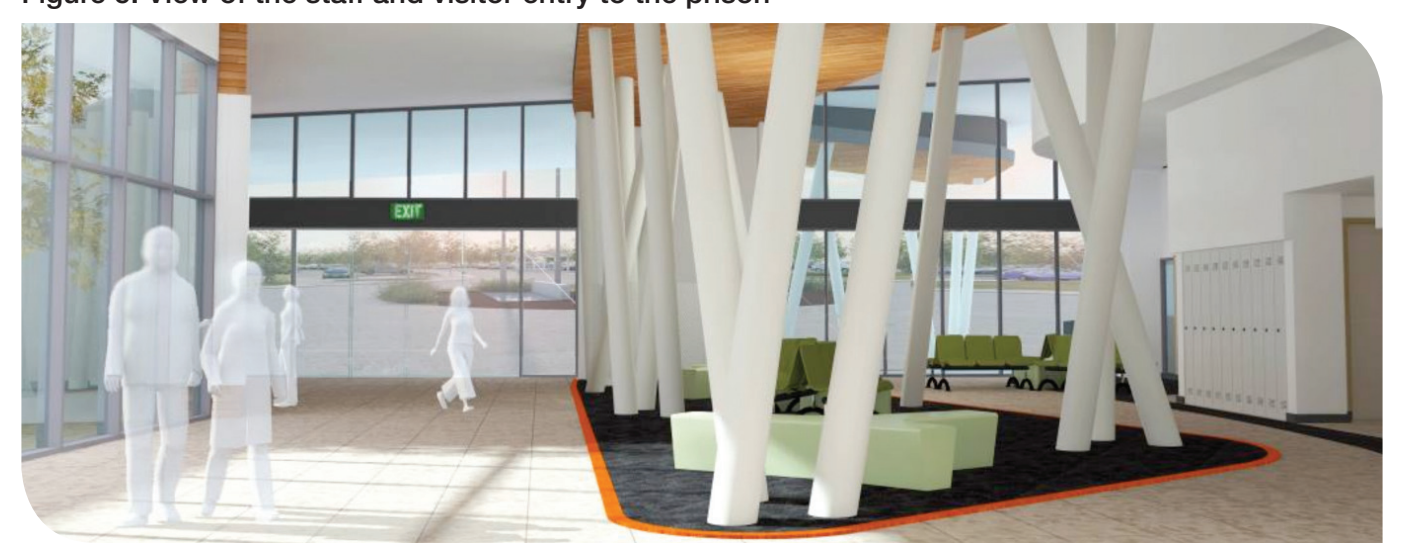
Figure 5: View of the staff and visitor entry to the prison

The Evaluation Panel reported to an Interdepartmental Steering Committee, which included senior representatives of the Department of Justice & Regulation, the Department of Treasury and Finance and the Department of Premier and Cabinet.