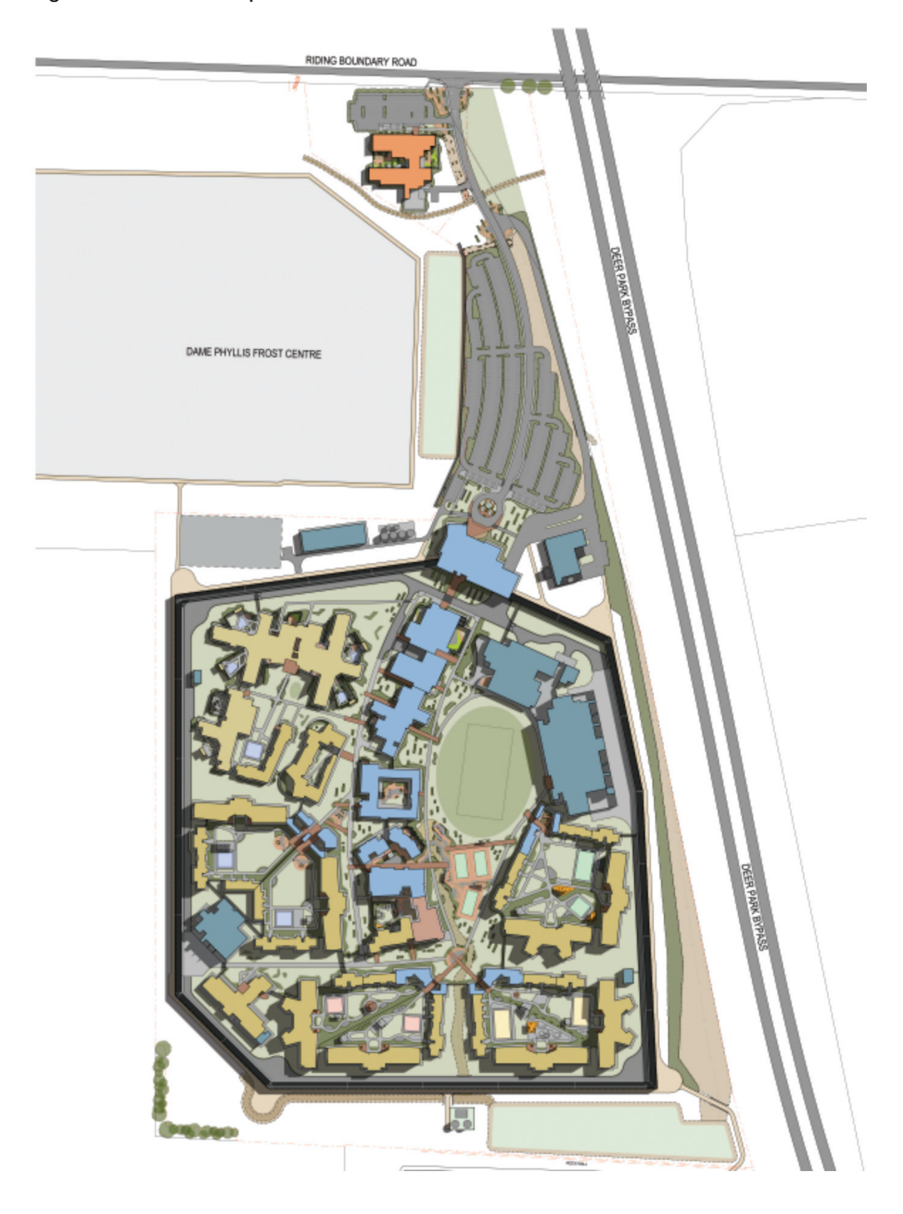
Figure 3: Prison masterplan