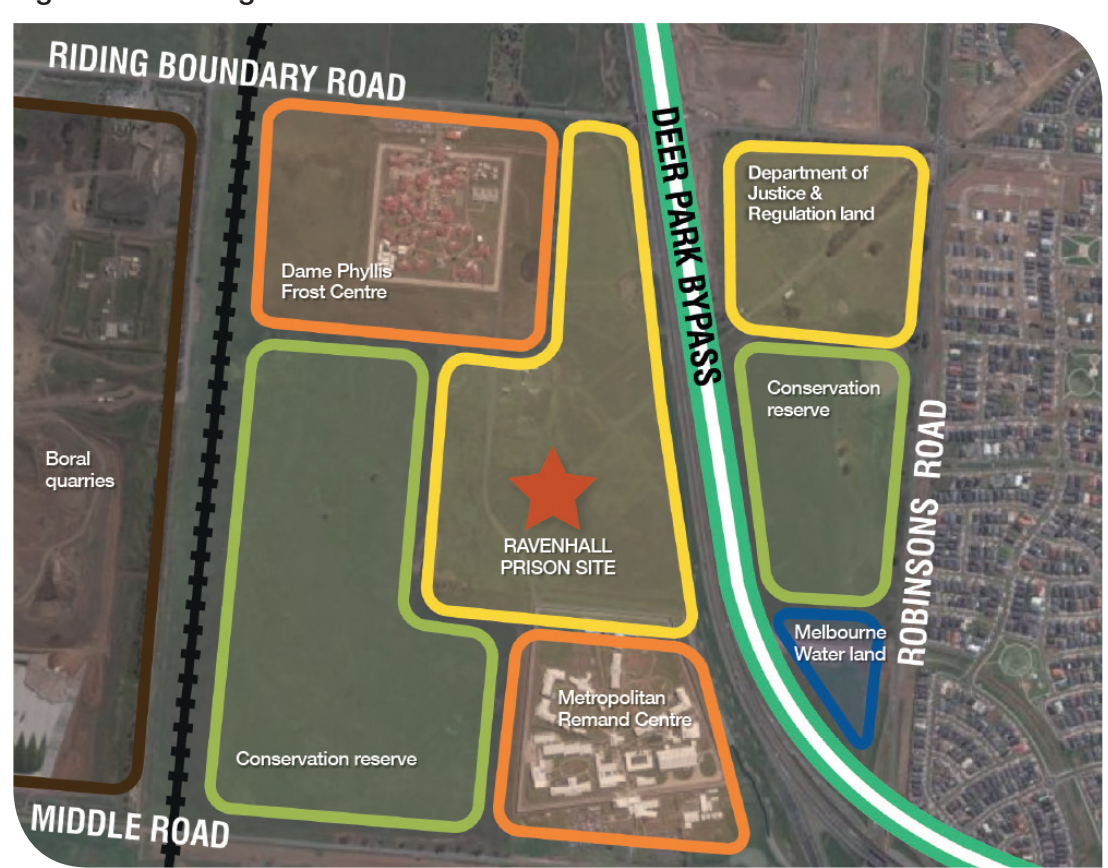
Figure 2: Site diagram

The land is generally flat and consists of open paddocks that contain patches of remnant native grassland and some scattered trees. All required planning, environmental and cultural heritage approvals for this site are in place. The site is buffered to the west by a conservation reserve, the Regional Rail Link, a quarry and landfill, and to the east by the Deer Park Bypass and a conservation reserve. To the north is the Dame Phyllis Frost Centre and to the south is the Metropolitan Remand Centre.