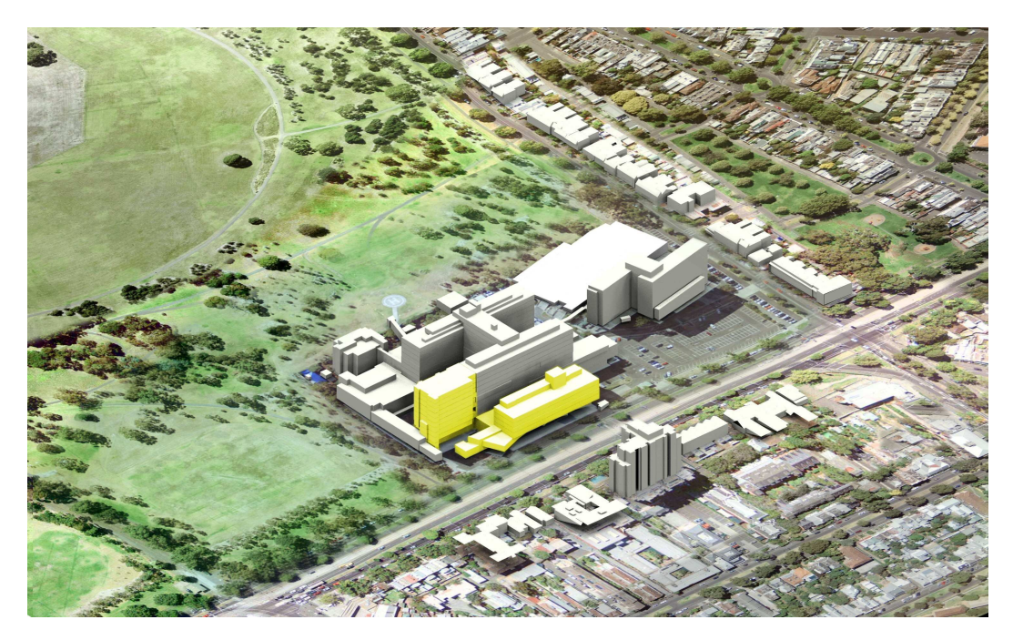
Figure 1: Existing RCH facility

Figure 1 is a representation of the existing RCH site, with the Front Entry Building and Research Precinct Building highlighted in yellow. Figure 2 provides an artist's impression of the new facility.