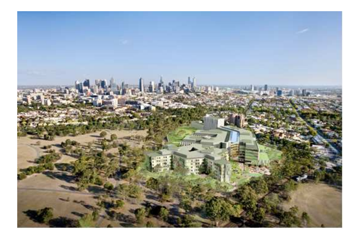
Figure 2: Artist's impression of the new RCH